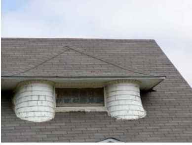
HIPPED DORMER WINDOW w/ ROUNDED WALLS