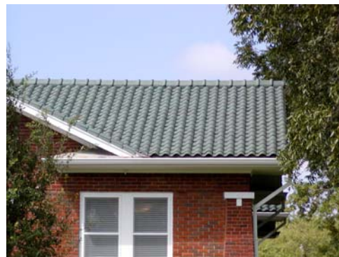
CERAMIC TILE ROOF

Other roofing materials typically used on more elaborate residential and commercial buildings in the early 20 th century included ceramic tile (glazed and unglazed), cement tile, stone and slate tiles.