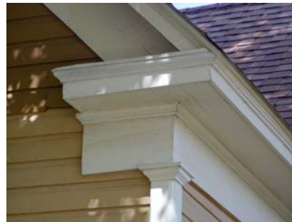
EAVE RETURN AT GABLE