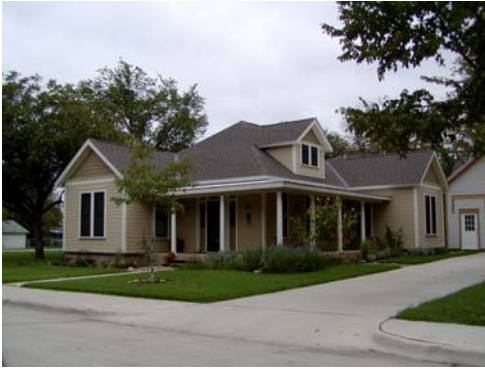
HIPPED ROOF w/ FRONT AND SIDE- FACING GABLES AND DORMER

Flat roofs are roofs with a pitch or slope sufficiently low that it can be walked upon easily; this may be a true horizontal plane or have a low pitch for rainwater drainage. Typically used at historic commercial buildings on Main Street, flat roofs are typically surrounded by a parapet or have only a gravel stop at the rear perimeter (facing the alley).