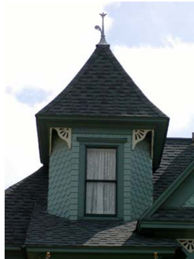
DORMER AT GABLE ROOF