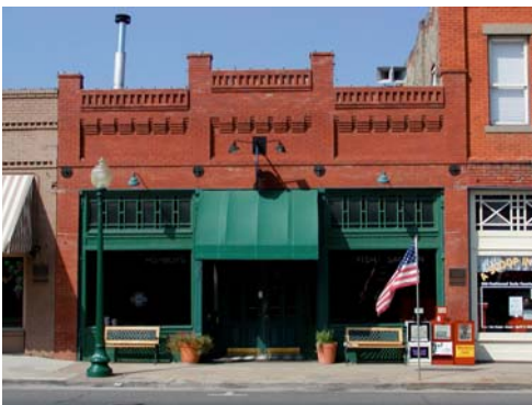
FLAT ROOF AT COMMERCIAL BUILDING

Flat roofs are roofs with a pitch or slope sufficiently low that it can be walked upon easily; this may be a true horizontal plane or have a low pitch for rainwater drainage. Typically used at historic commercial buildings on Main Street, flat roofs are typically surrounded by a parapet or have only a gravel stop at the rear perimeter (facing the alley).