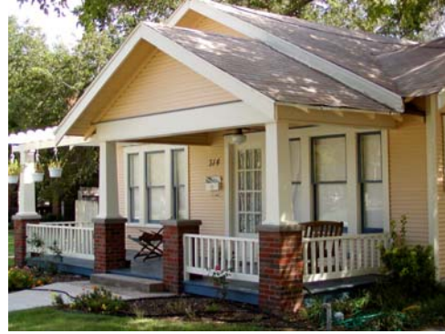
GABLED ROOF w/ EXPOSED RAFTERS (FRONT FACING GABLE AT PORCH)

Please note that while houses may have one dominant roof style, they can have minor forms or components of another style. For example, many Tudor Revival houses will have gables at the front elevation, but have hip roofs in the back of the house.