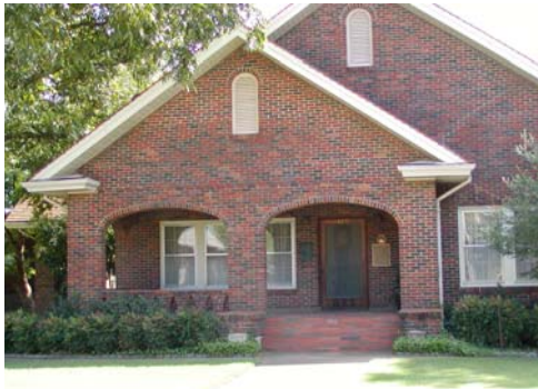
GABLED ROOF (FRONT FACING BRICK GABLE)

A hip roof is a roof that slopes inward from all exterior walls, and forms either a pyramid roof form or one with a ridge that all four (or more) roof planes adjoins. Pyramid roofs are typically found at smaller, square houses while hip roofs with a ridge are used at rectangular or more complex building plans.