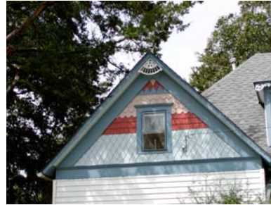
FISHSCALE WOOD SIDING AT GABLE (VICTORIAN)

of some of these components found in Grapevine are shown following: