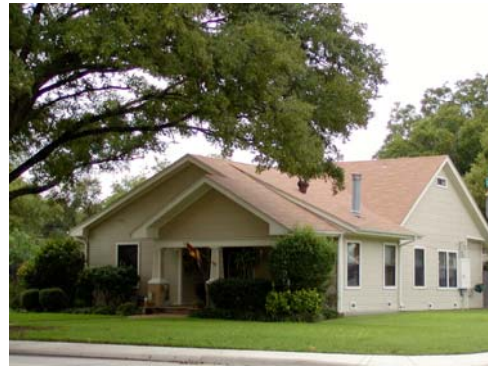
FRONT FACING GABLE ROOF w/ SIDE- FACING GABLE