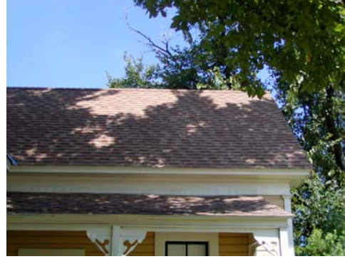
ASPHALT SHINGLE ROOF (ARCHITECTURAL GRADE SHINGLES)

Composition shingles have been a popular and widely used roofing material since the early decades of the 20 th century. Asphalt composition shingles have replaced wood shingles and ceramic tile roofs due to their ease of installation, low cost and availability. In addition, they are fire-resistant which in urban areas, is preferred by building officials. Originally available in many patterns – variegated, diamond and plain (or square) – and colors (green, red, greys and browns), these are typically used in patterns and colors to imitate wood shingles. Since the early 1980's, thicker composition shingles styles are available which offer a longer life (30-year), have a more rugged appearance are available in a selection of natural colors (greys and browns), thus giving an appearance of wood shingles; these are typically referred to as 'architectural grade roof shingles'.