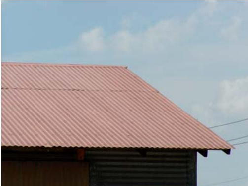
METAL ROOF (CORROGATED METAL)

surfaces created interesting patterns, were popular throughout the country in the late 19th century. Tin roofs were often kept well-painted in red or green to imitate the green patina of copper. Unfortunately, few of these roofs remain intact today.